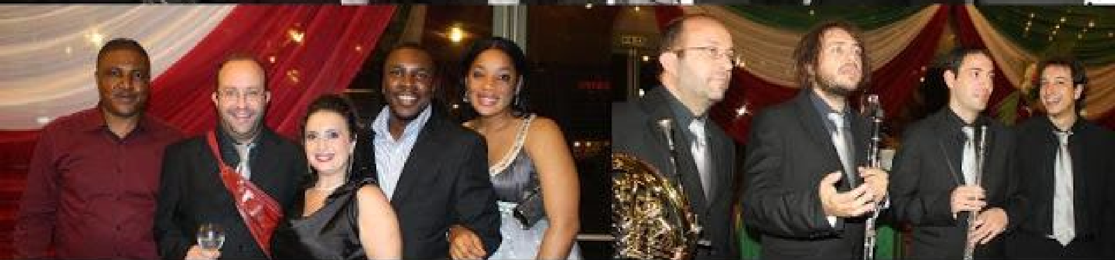
BelCanto Ensemble Concert (organized by the Italian Embassy) October 17, 2011, Transcorp Hilton Hotel, Abuja, Nigeria