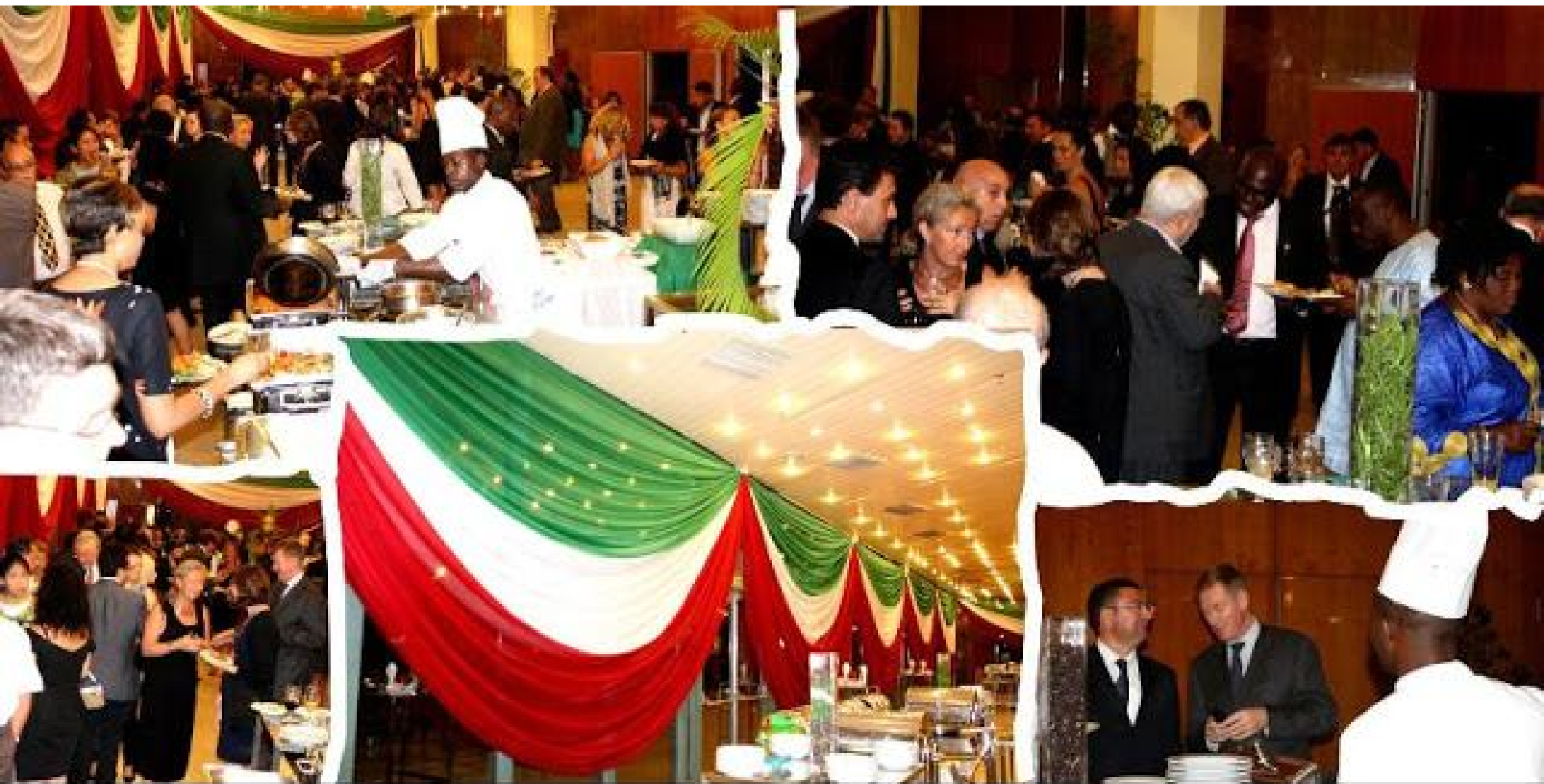
Belcanto Ensemble Concert (organized by the Italian Embassy) October 17, 2011, Transcorp Hilton Hotel, Abuja, Nigeria