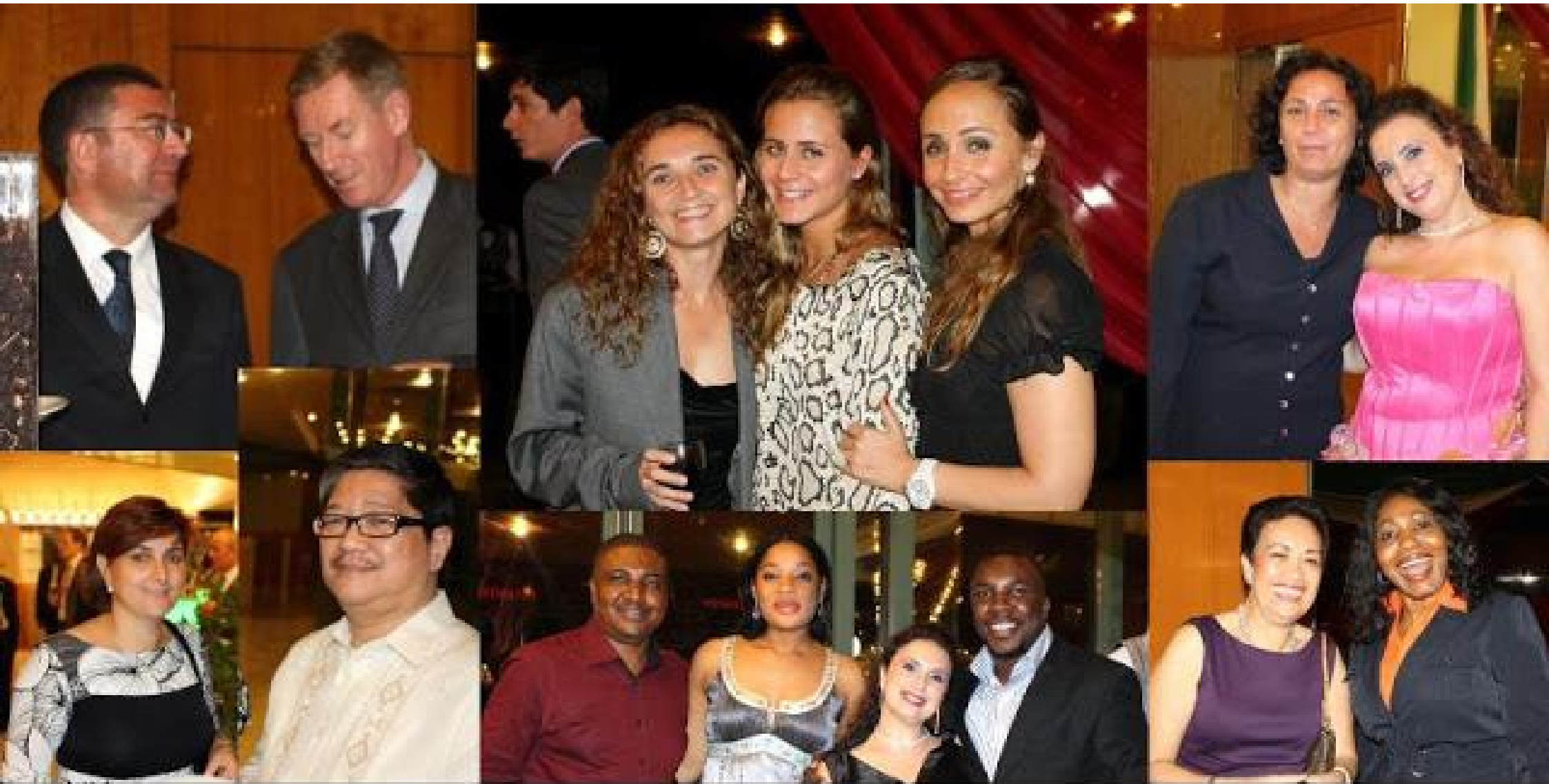
BelCanto Ensemble Concert (organized by the Italian Embassy) October 17, 2011, Transcorp Hilton Hotel, Abuja, Nigeria