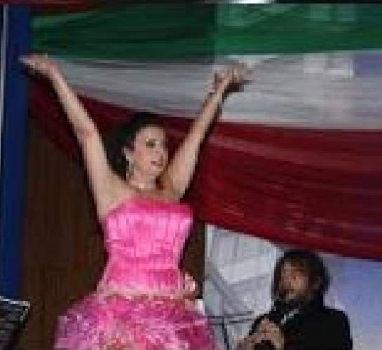
Belcanto Ensemble Concert (organized by the Italian Embassy) November 2011, Transcorp Hilton Hotel, Abuja, Nigeria